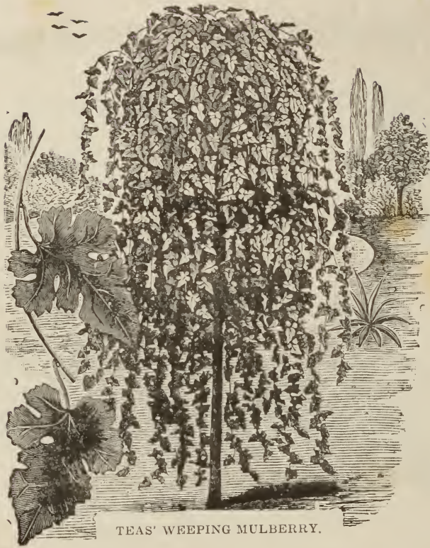
TEAS' WEEPING MULBERRY.